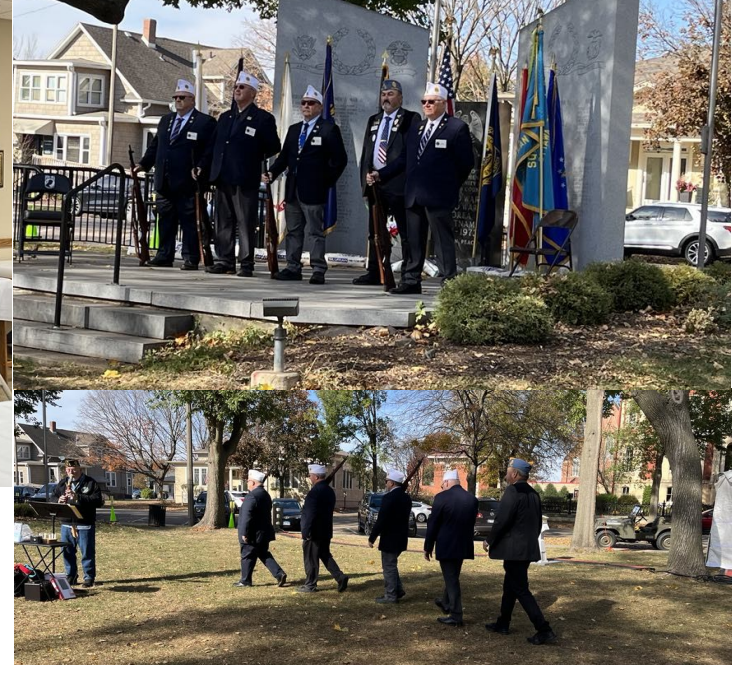
Department leadership in Utica, Illinois for the parade on Saturday, November 2.